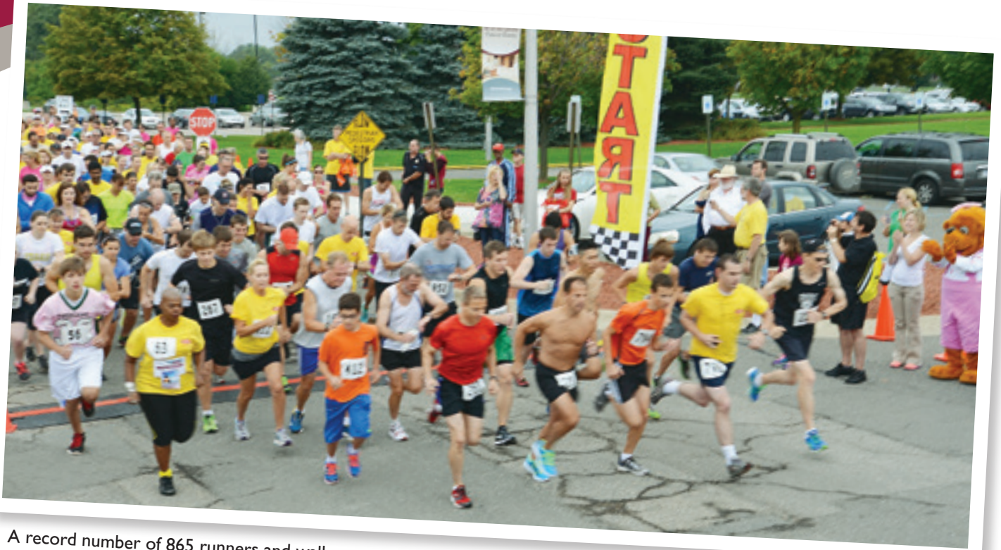
A record number of 865 runners and walkers registered for St. Mary Mercy Hospital's 7th Annual Embrace Life 5K run/walk.