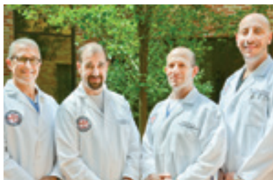
Emergency medicine graduates

the Class of 2013 graduates, please visit stmarymercy.org/graduates .