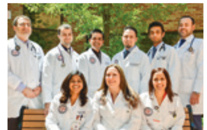
Internal medicine graduates