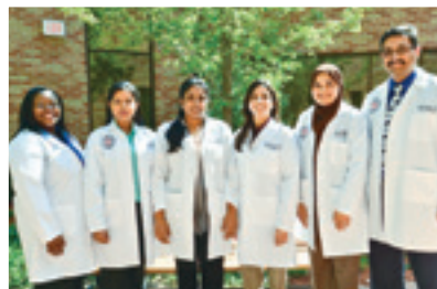
Family medicine graduates