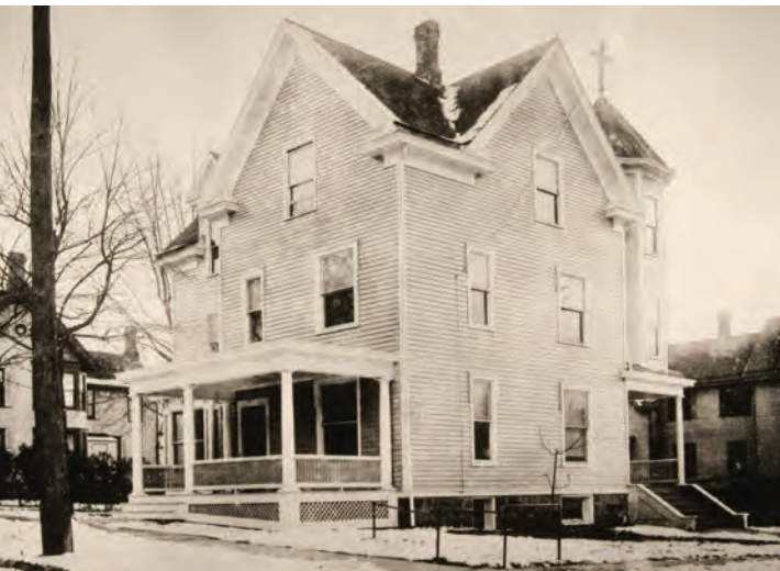
1911 first St. Joe’s Hospital on State Street

To learn about how ongoing support makes a difference, visit: stjoeshealth.org/giving