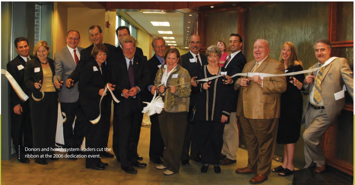
Donors and health system leaders cut the ribbon at the 2006 dedication event.