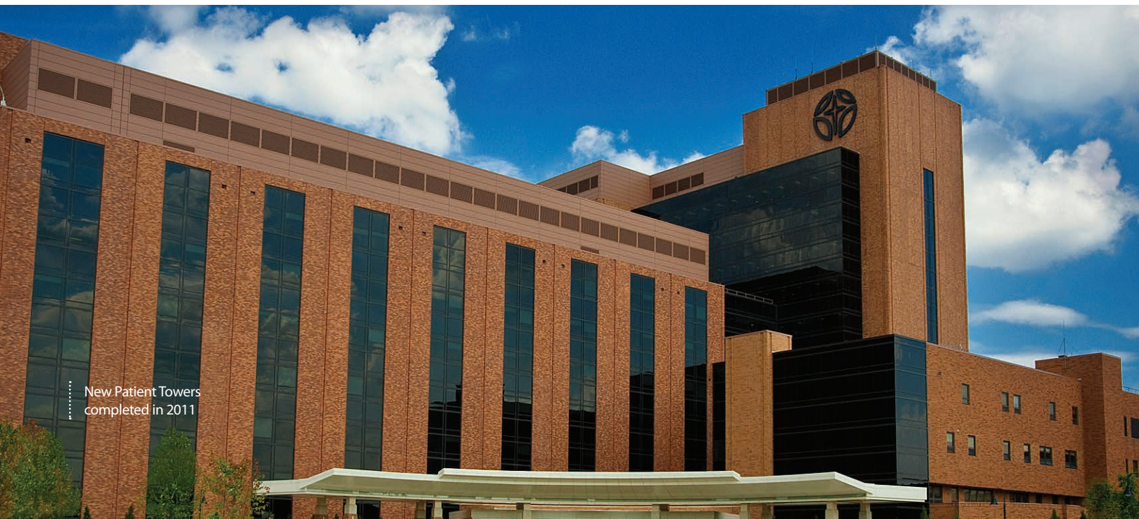
New Patient Towers completed in 2011